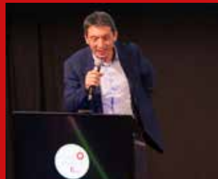
Mayor of Cremona Gianluca Galimberti