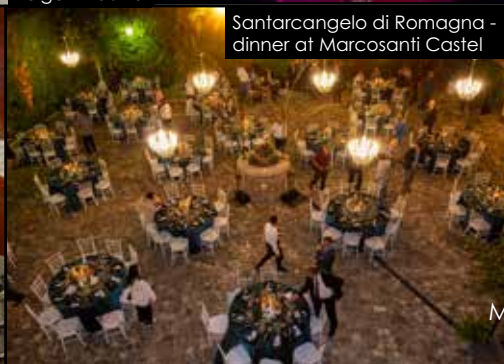
Santarcangelo di Romagna - dinner at Marcosanti Castel