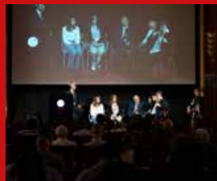
Conference debate Q&A