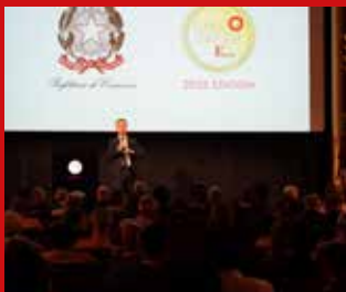
Prefect of Cremona, Corrado Conforto Galli